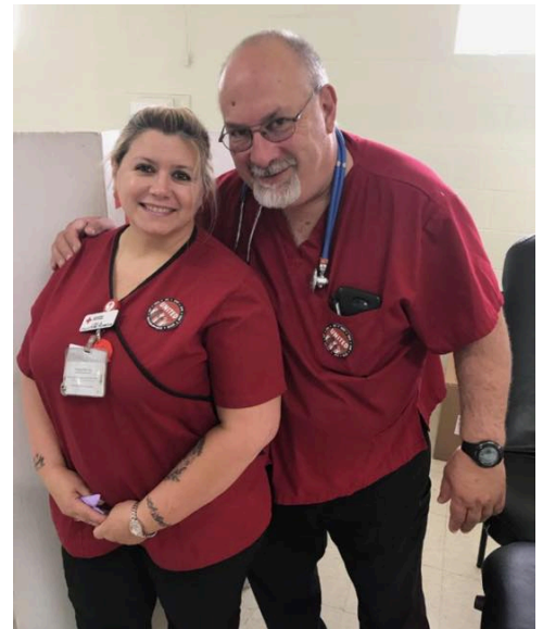
SEIU Local 1989 * Maine