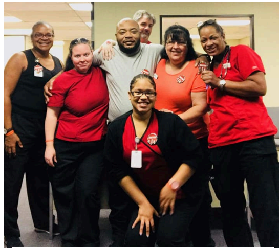
CWA * Albany NY