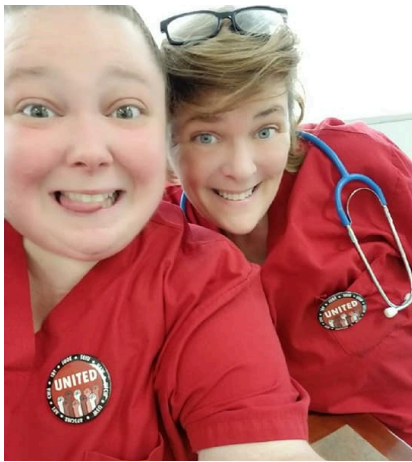
Teamsters Local 507 * Ohio