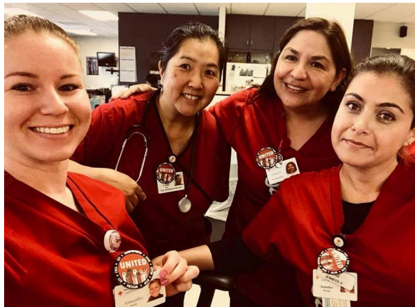
SEIU Local 721 * Southern California