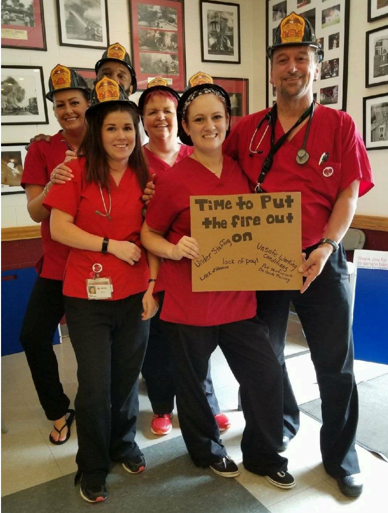
HPAE/AFT Local 5103 * Penn-Jersey

We reached tentative agreements on some important issues, including worker safety and more flexibility when scheduling rest breaks.