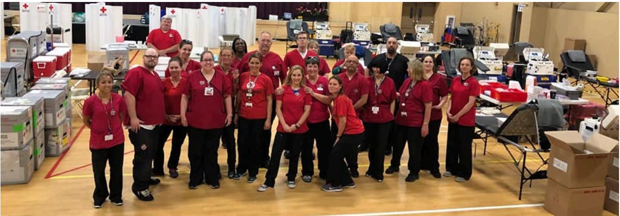
UAW Local 2322 * Massachusetts

We are wearing buttons to show Red Cross that we are paying attention to these negotiations and that we care about the outcomes.