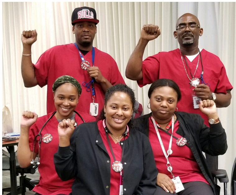
USW Local 254 * Georgia

Many Red Cross workers are not paid livable wages and it is a struggle to make ends meet. While the Red Cross responds effectively to the needs of disaster relief victims and provides other critical services, it oftentimes fails to address the basic needs of its employees who perform this work. We want to know more! Please take time to complete the survey link sent to you this week from your union. Remind your co-workers to complete the surveys. The Union bargaining committee and public relations team will collect and communicate your concerns.