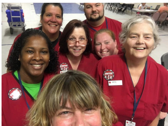
CWA Local 13500 * Pennsylvania